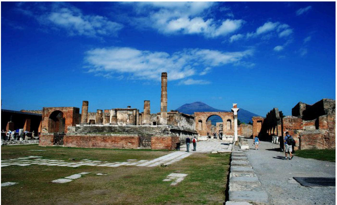
Figure 8 – Pompeii, Archaeological site, detail.

weathering forms and damage categories (Grifa et al. 2016). The House of the Vestals, an ancient elite house in Pompeii ( Regio VI, insula 1 ), shows different types of mortar. Another research describes the compositional characterisation of cocchiopesto and natural pozzolanic mortars sampled in the Regio VI area of the archaeological site of Pompeii, with particular reference to the Casa di Pansa in Insula