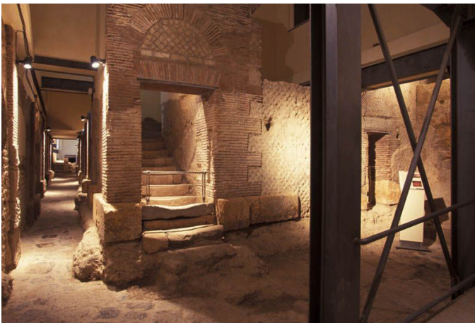
Figure 3 – Rione Terra, Roman Building, detail.