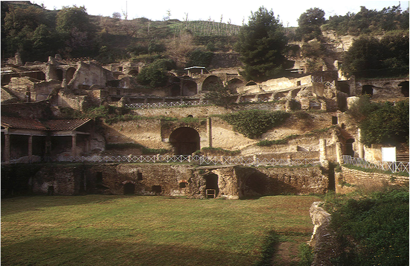
Figure 5 – Baia, Archaeological complex of "Terme di Baia".

The first site that we investigated was the entrance channel to Baianus Lacus , distinguished by two long moles or breakwaters. Each mole is about 9.5 mt. wide, while the channel between them is about 32 mt. wide. A similar location selected for coring was the entrance channel to the now submerged harbour of Portus Iulius . This installation was the first one built in the Italian peninsula specifically to serve as a base for a naval fleet. It was constructed clandestinely in the early 30s B.C. by Marcus Agrippa (Brandon et al. 2014).