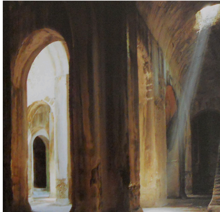
Figure 7 – Misenum, Piscina Mirabilis.