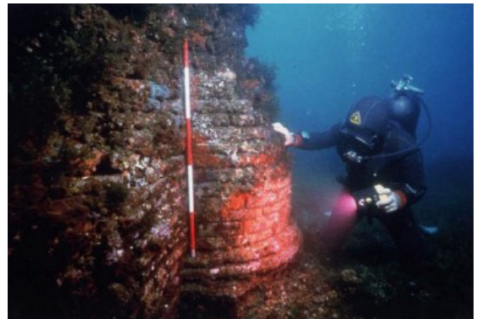
Figure 4 – Baia, Roman submerged building, detail.

has been carried out: the Villa with entrance as a prothyrum, Villa dei Pisoni, a sector of the so called Via Herculanea and the Building with porticoed courtyard near Portus Iulius .