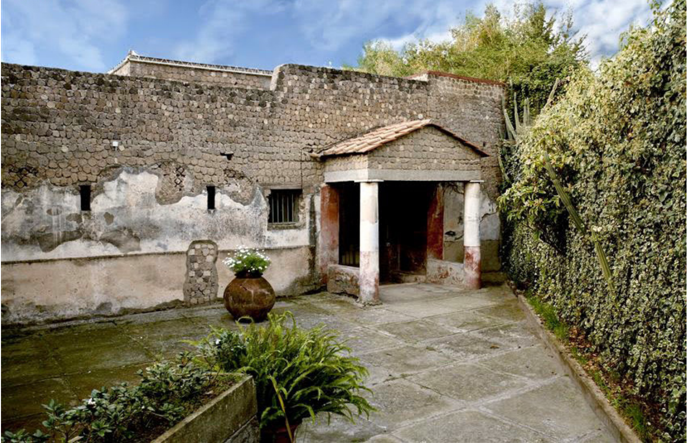
Figure 10 – Stabiae , Villa San Marco, detail.