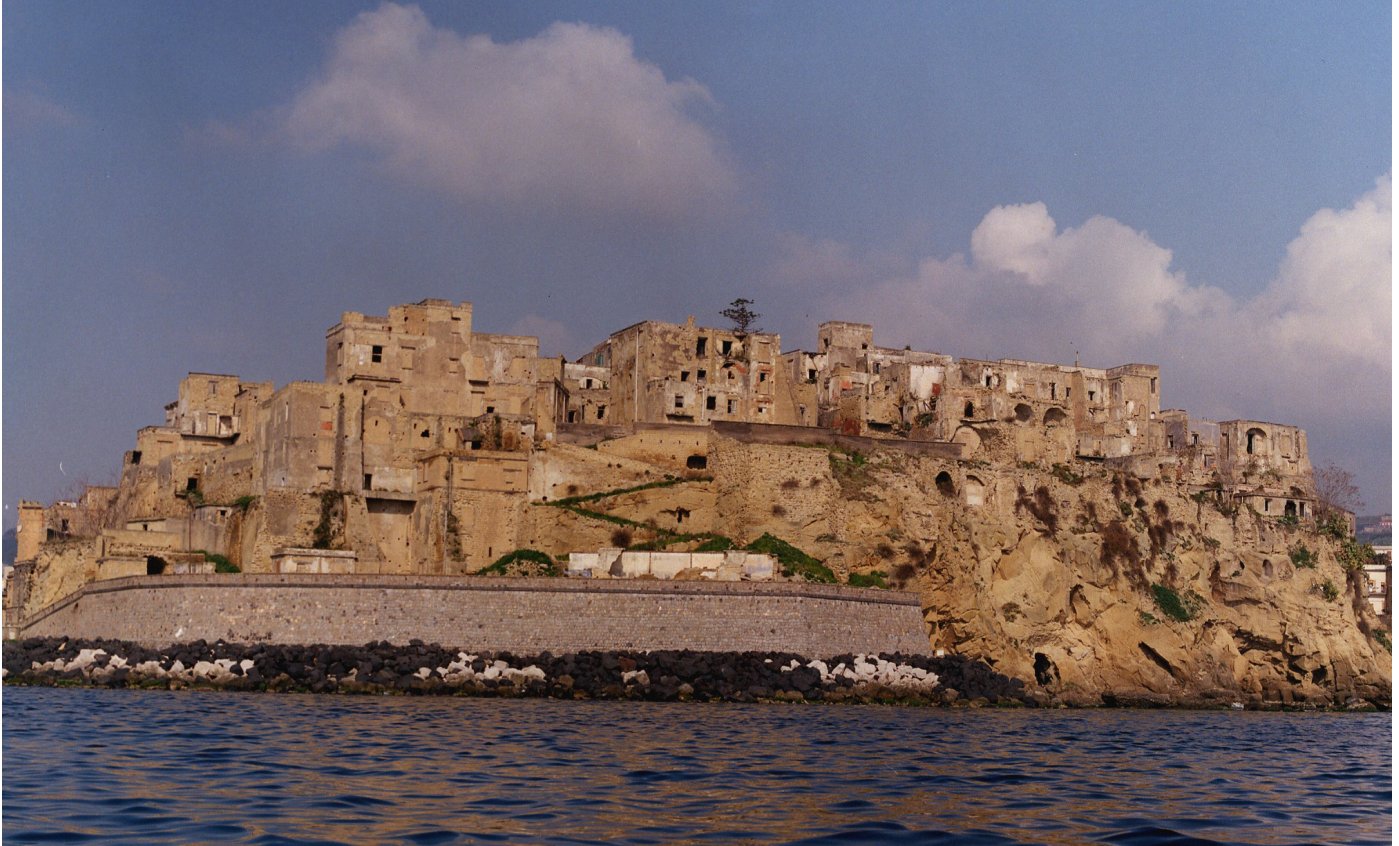
Figure 2 – Rione Terra in Pozzuoli, view from the sea.