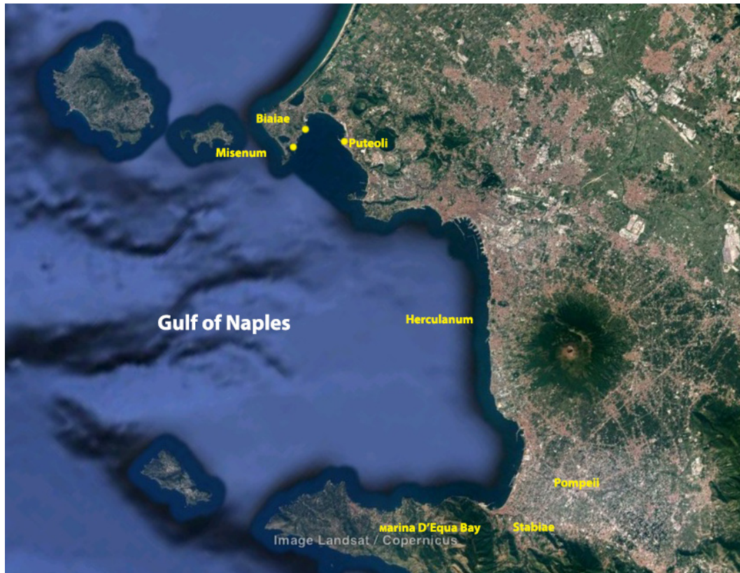
Figure 1 – Roman cities in the Gulf of Naples.